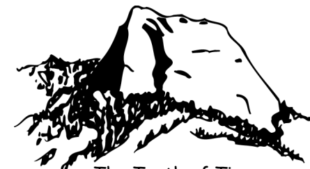
The Tooth of Time 14