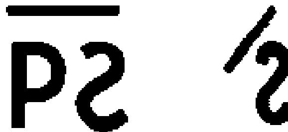
Philmont's Cattle and Horse Brands