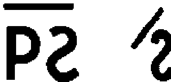
Philmont's Cattle and Horse Brands